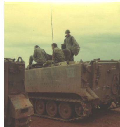
8 Some Grunts - From Tom Kearney.jpg (1142x1200)