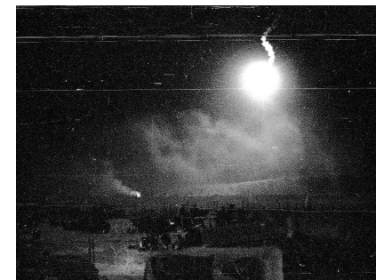
4 More Flares over the Hardspot during February 1969 Attack.jpg (1895x1433)