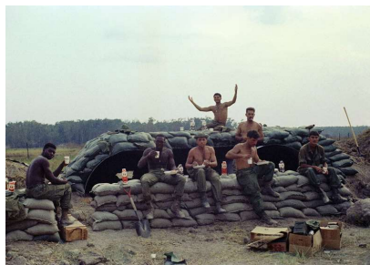
1 HS Bunker Santiago Arms - From Bill Noyes.jpg (800x559)